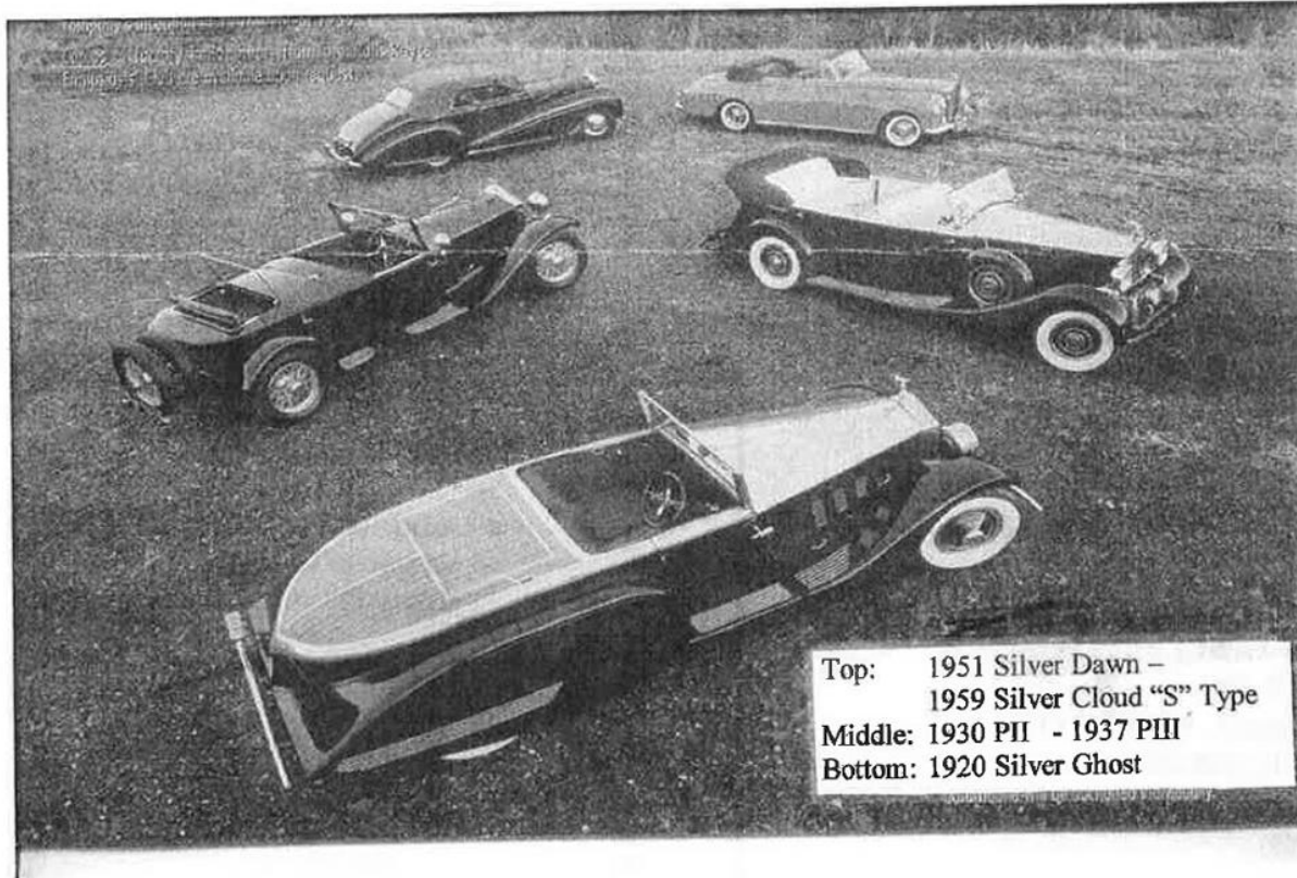
Top: 1951 Silver Dawn - 1959 Silver Cloud "S" Type Middle: 1930 PII - 1937 PIII Bottom: 1920 Silver Ghost

These Rolls-Royces were seized in May, 1998 by the U.S. Department of Treasury and placed on auction on March 10, 2000 in Edison, New Jersey.