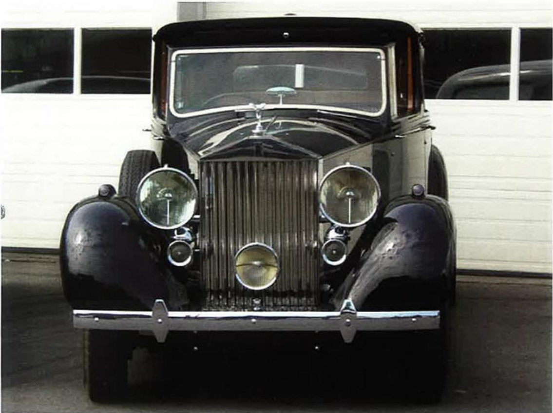
3DL188 1938 Phantom III Hooper Sedan de ville