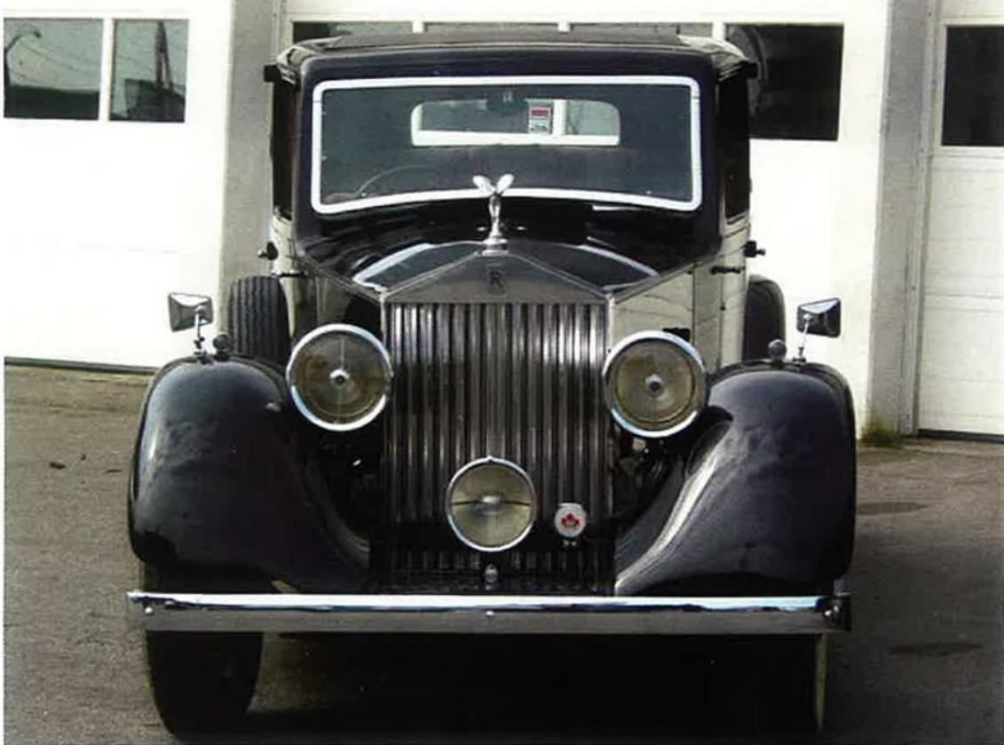
G CJ17 20/25 Barker four light saloon.