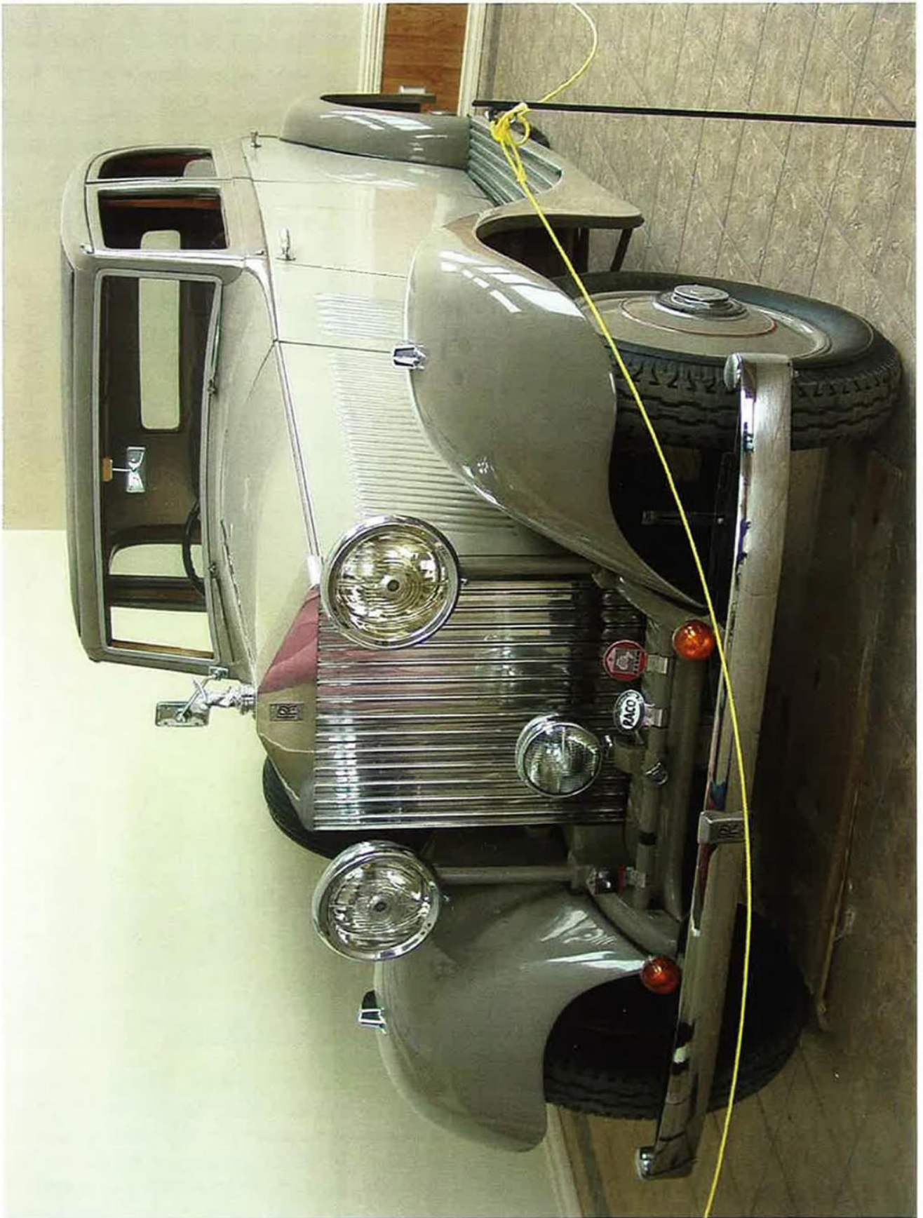
GRC72 1934 20/25 Hooper Saloon.