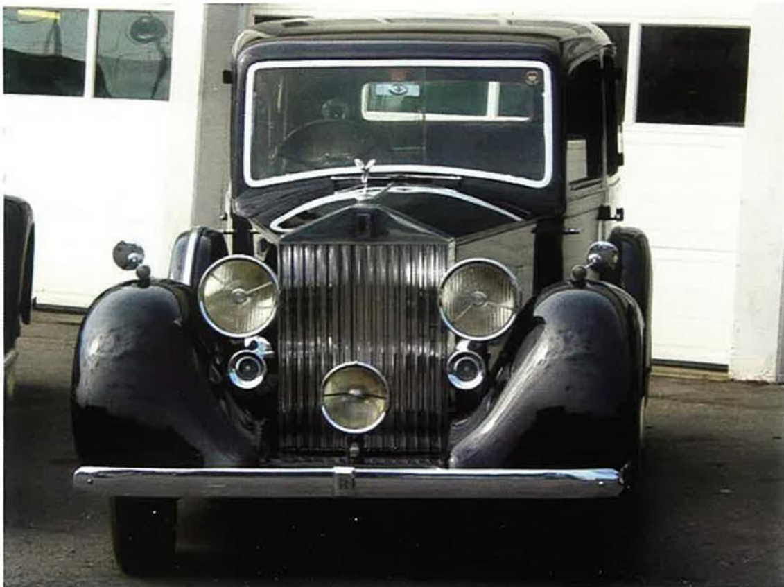
GAR12 1937 25/30 Windovers Limousine