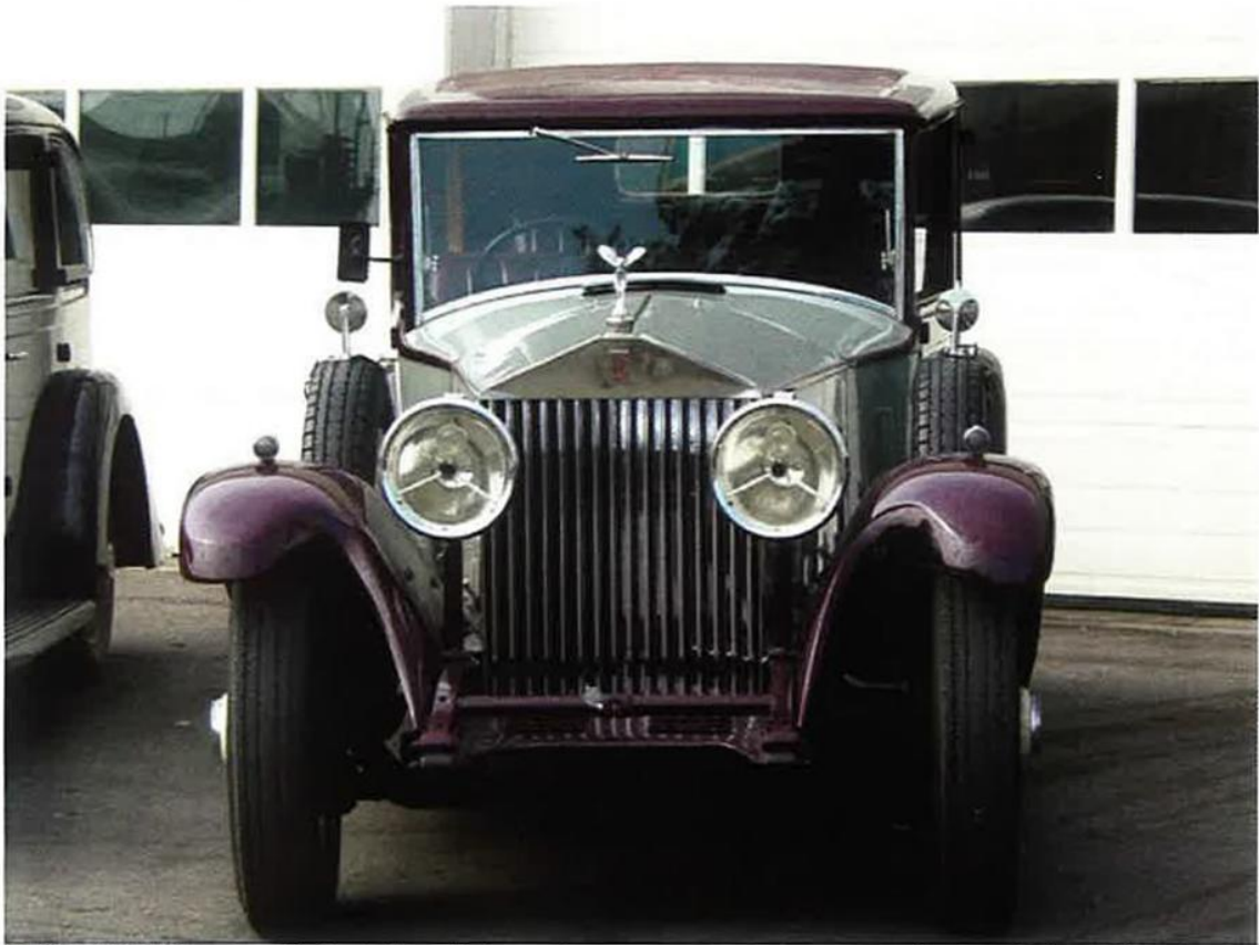
67GN 1930 Phantom II Park Ward Limousine