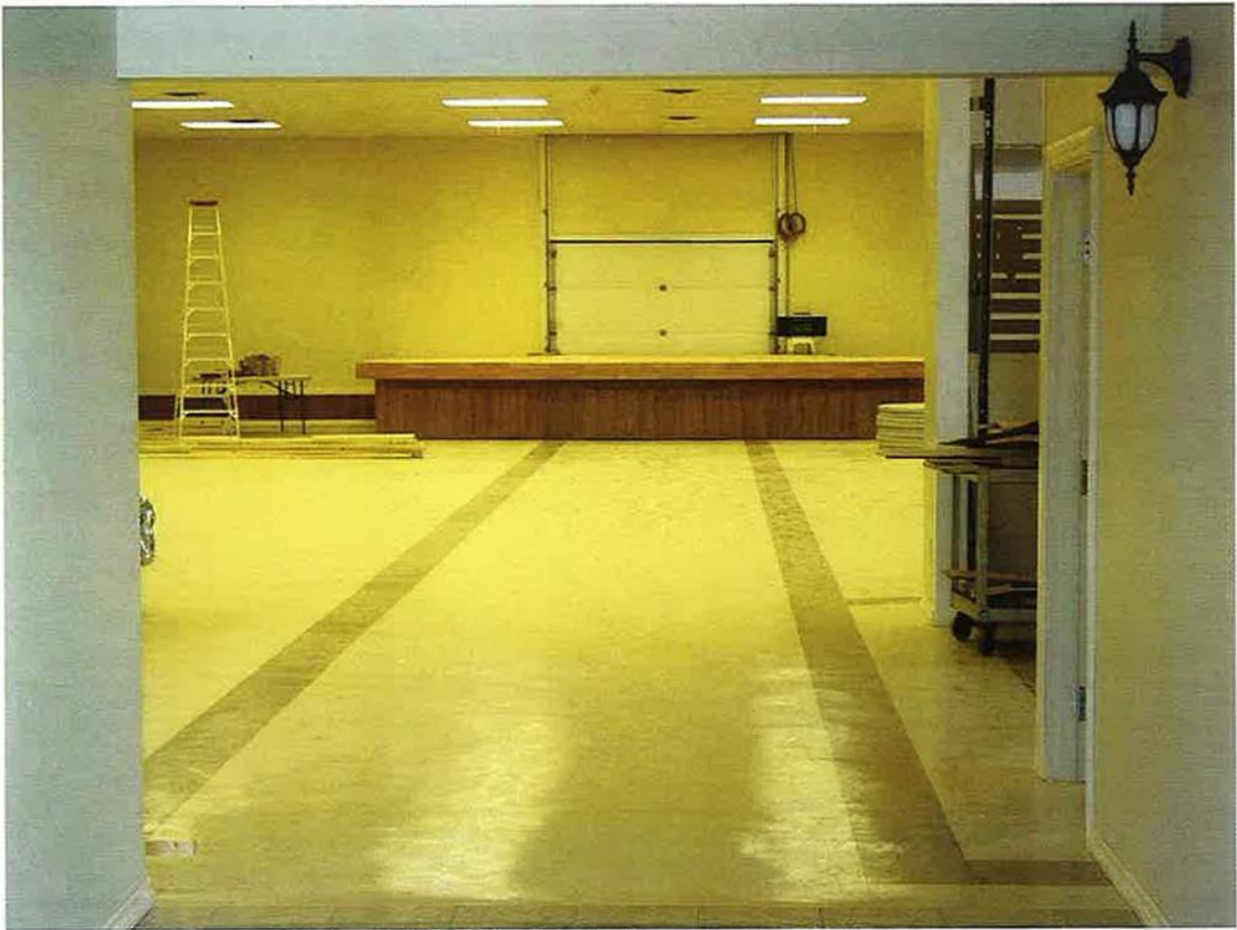
This and the following photographs show the interior