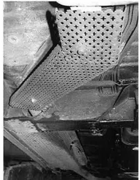
Full length heat shield on NAG-14941

I have included photographs of all of the cars and some of the participants. If I have incorrectly identified your car please let me know.