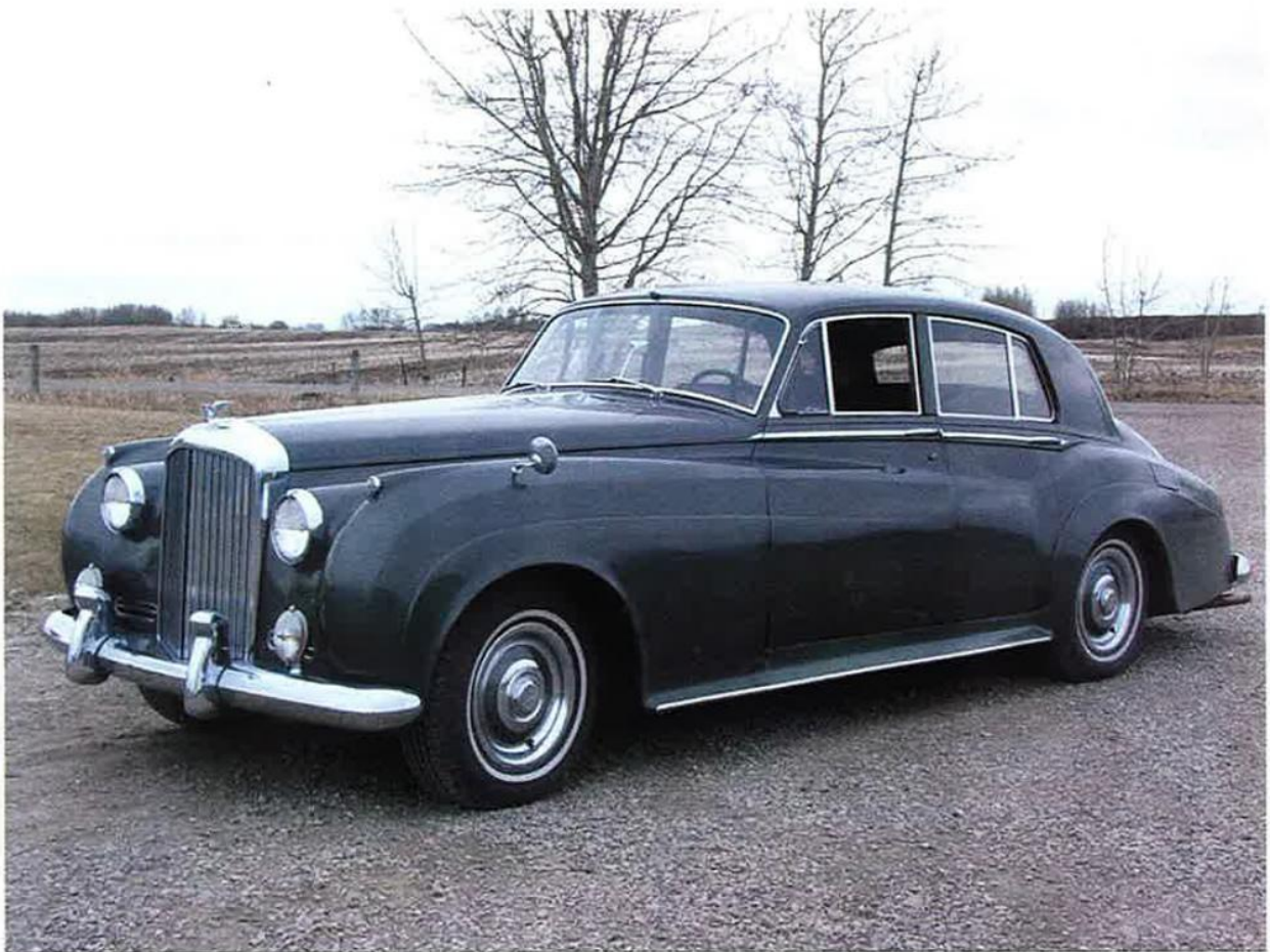
B187LBC 1956 Bentley S1 Saloon