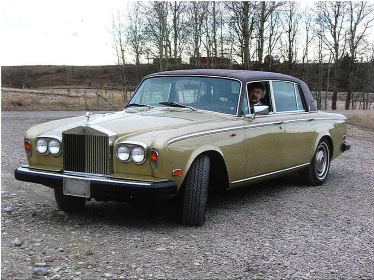
LRL41619C 1980 Silver Wraith II LWB Saloon