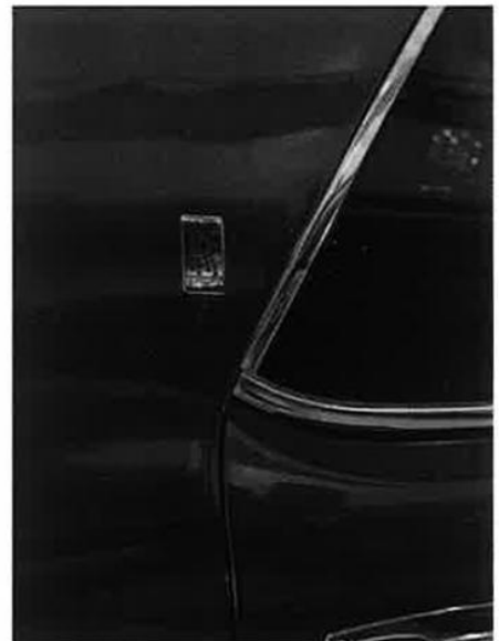
c-pillar badge on NAG-14941