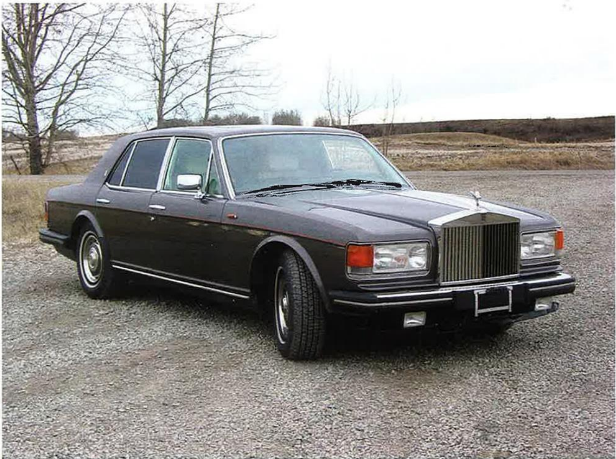
NAG14941 1986 Silver Spirit