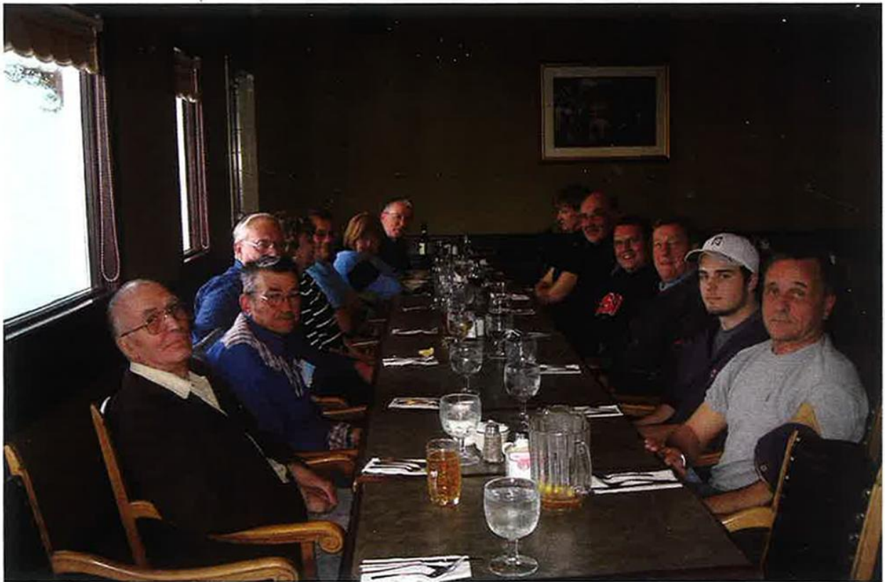
Above: The last supper