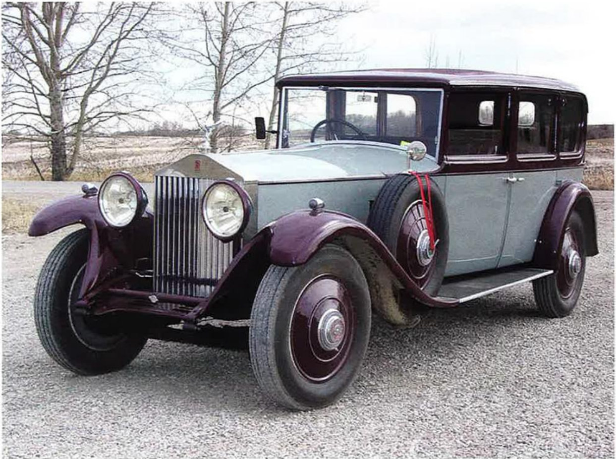
67GN 1930 Phantom II Park Ward Limousine