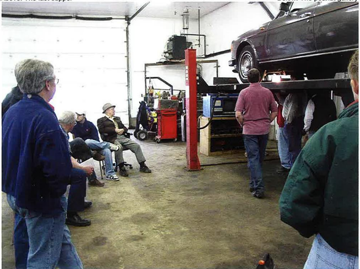
Below: The peanut gallery