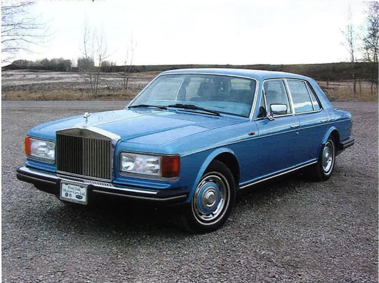
SAF-12987 1985 Silver Spirit saloon