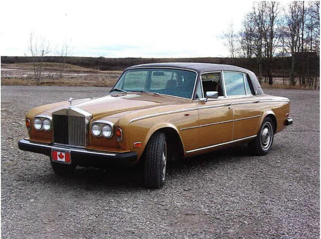
LRG34602 1978 Silver Wraith II LWB Saloon