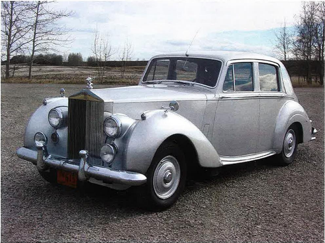
LSRH8 1954 Silver Dawn

Rolls-Royce Owners Club - Can-Am Prairie Region