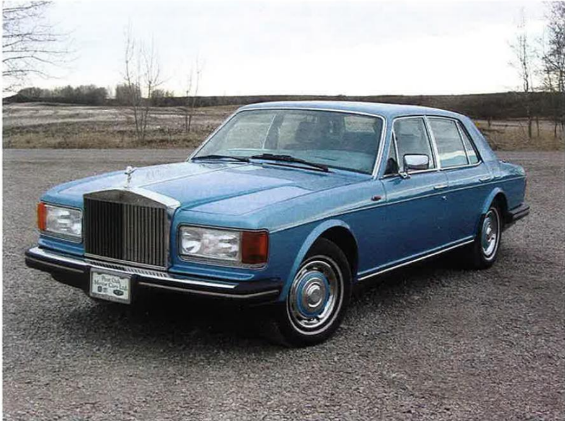
SAF-12987 1985 Silver Spirit saloon

up to the reservoir. Thus, any air in the system would be pushed back into the reservoir and rise out of the system through the fluid in the reservoir. Then, I could just push the pedal a few times and the entire system would have only fluid in it. It worked best when I temporarily installed very thin brake pads and elevated the bleed line above the valve.