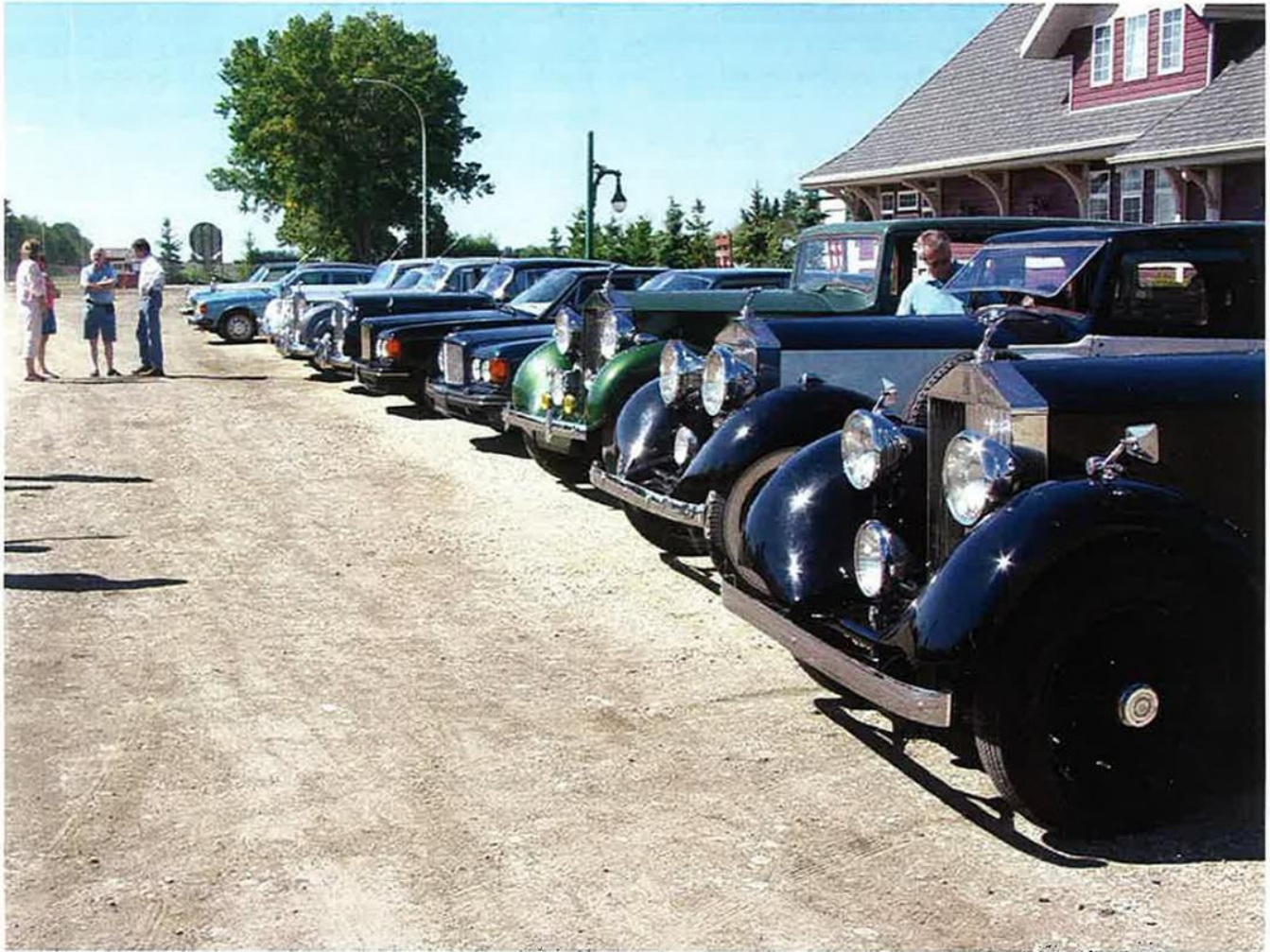
Some of the cars lined up at the Leduc Historical Society Grounds for the August 20 th Regional Meet

Rolls-Royce Owners Club - Can-Am Prairie Region