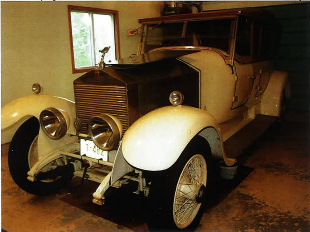
GRJ41 1927 20 H.P. Barker Tourer