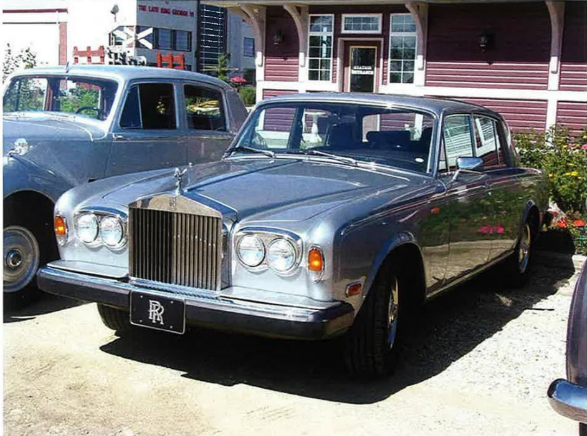
SRG34168 1978 Silver Shadow II