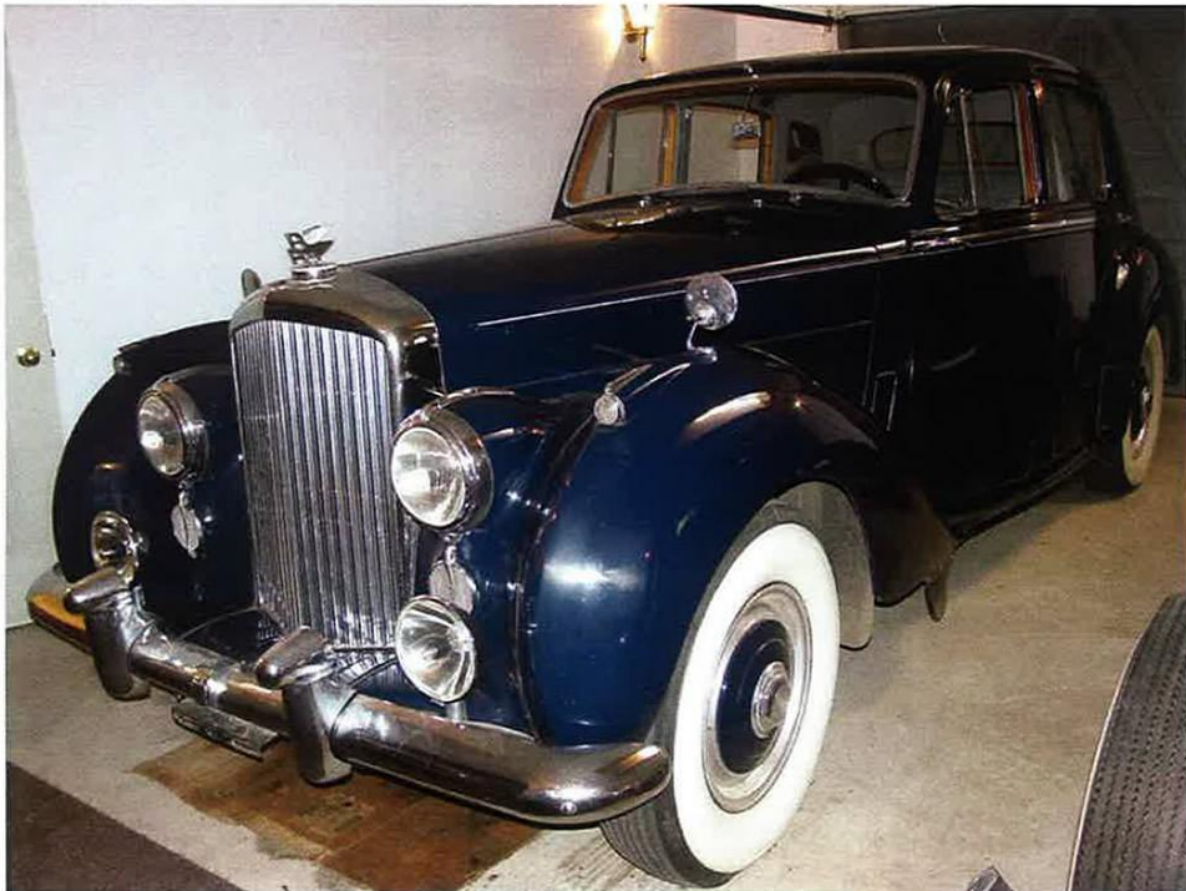
B363LSP 1953 Bentley R Type