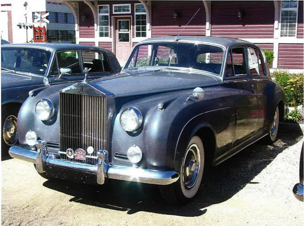
LSGE460 1958 Silver Cloud I