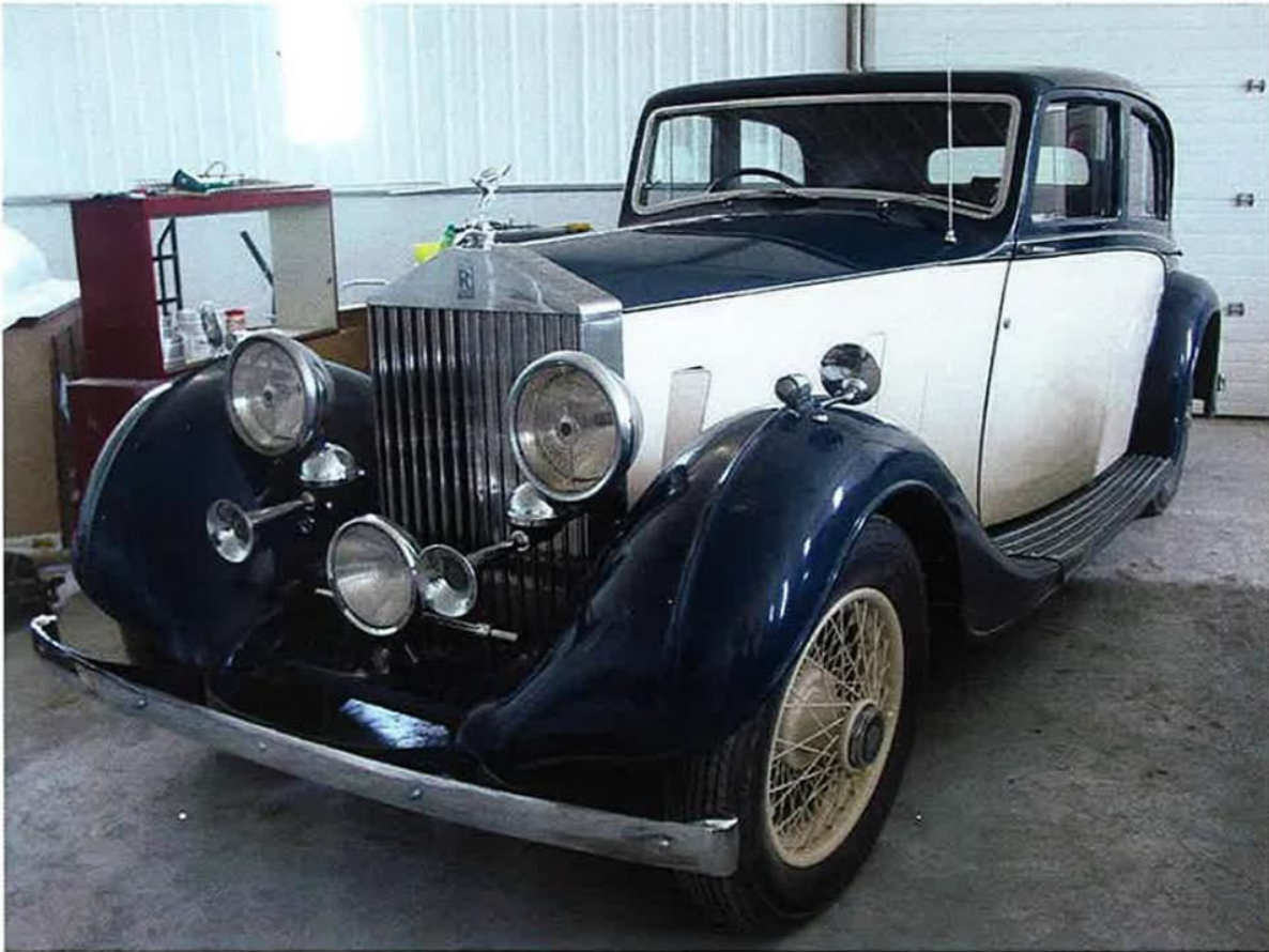
GHL29 1936 25/30 Maberly Saloon