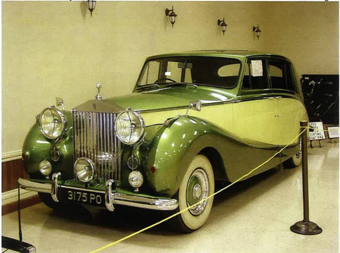
CLW35 1953 Silver Wraith Hooper Limousine