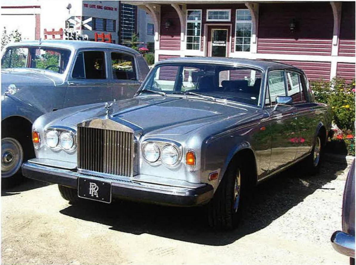
SRG34168 1978 Silver Shadow II