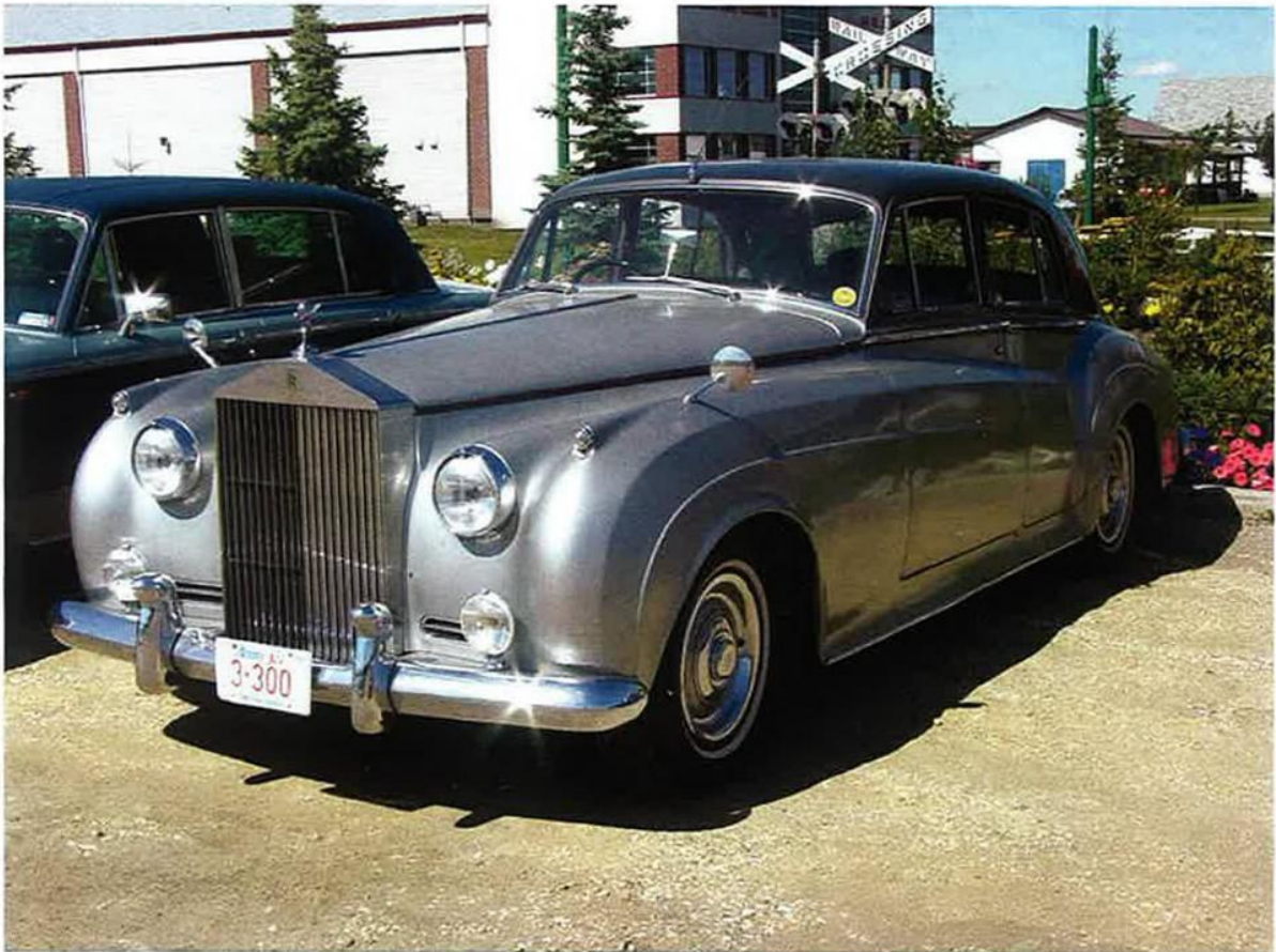
SDD168 1957 Silver Cloud I