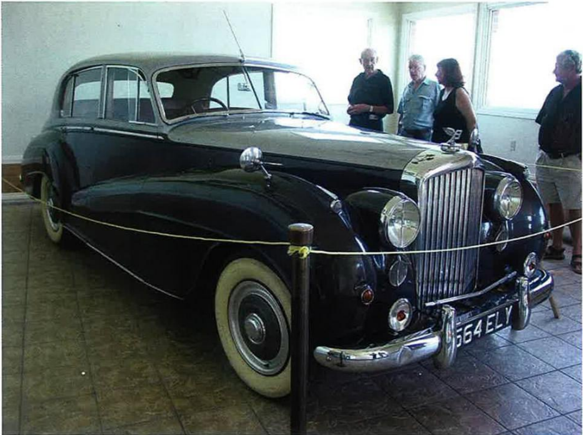
B199SP 1953 Bentley R Type H.J. Mulliner Saloon