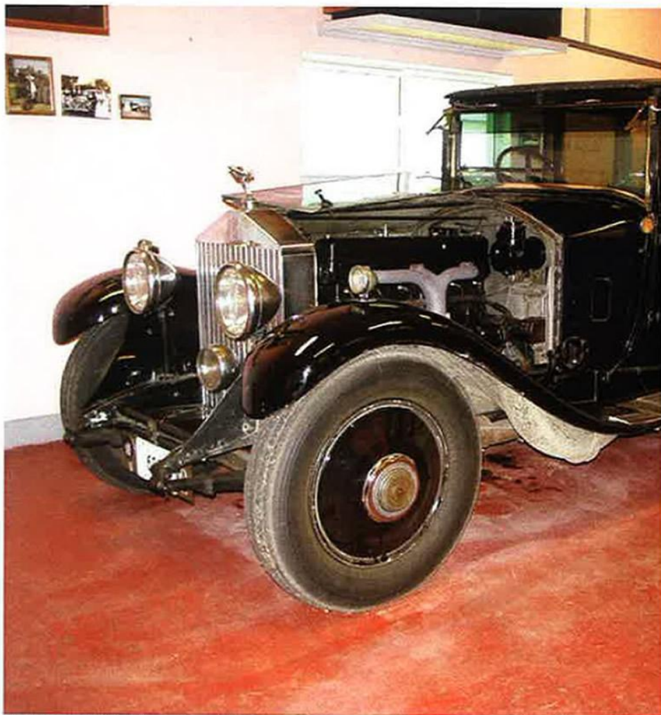
3AX47 1936 Phantom III Hooper Saloon