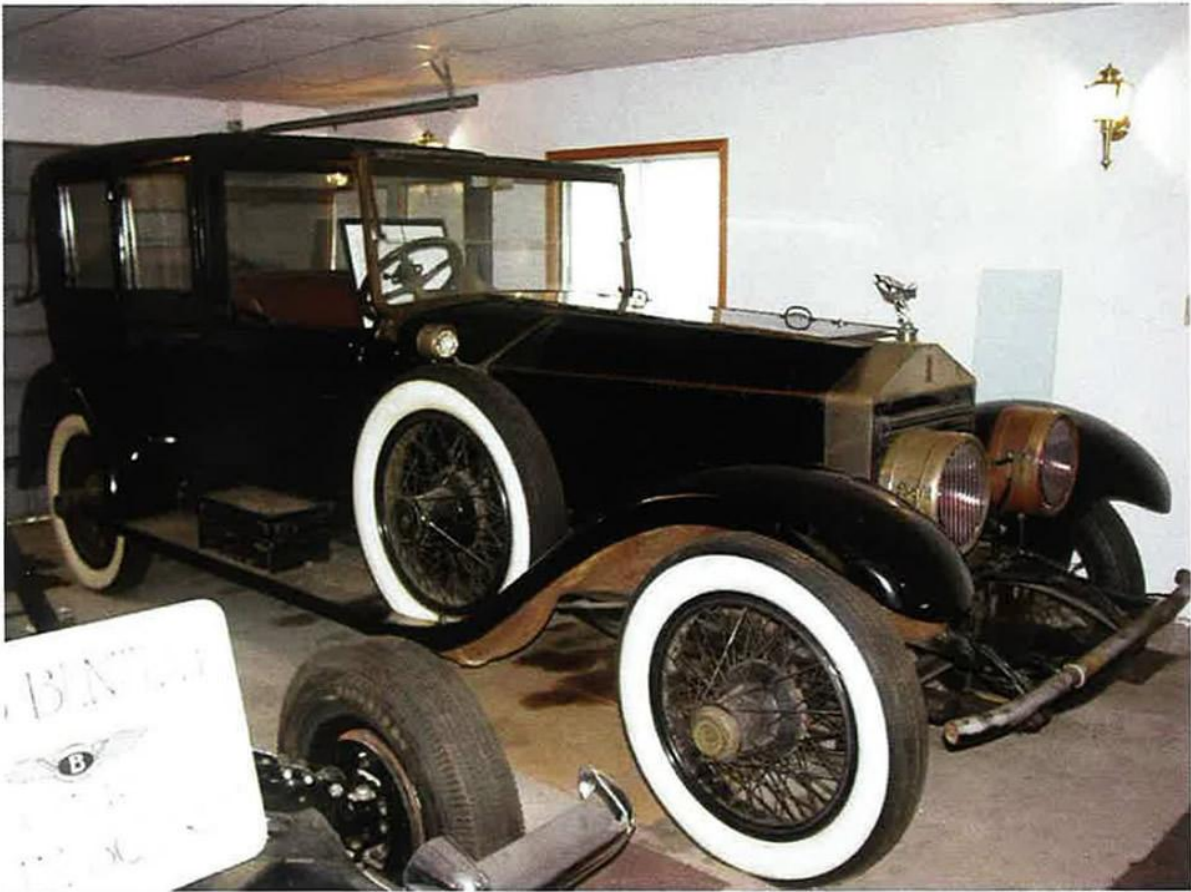
57JH 1923 Springfield Silver Ghost Holbrook Towncar